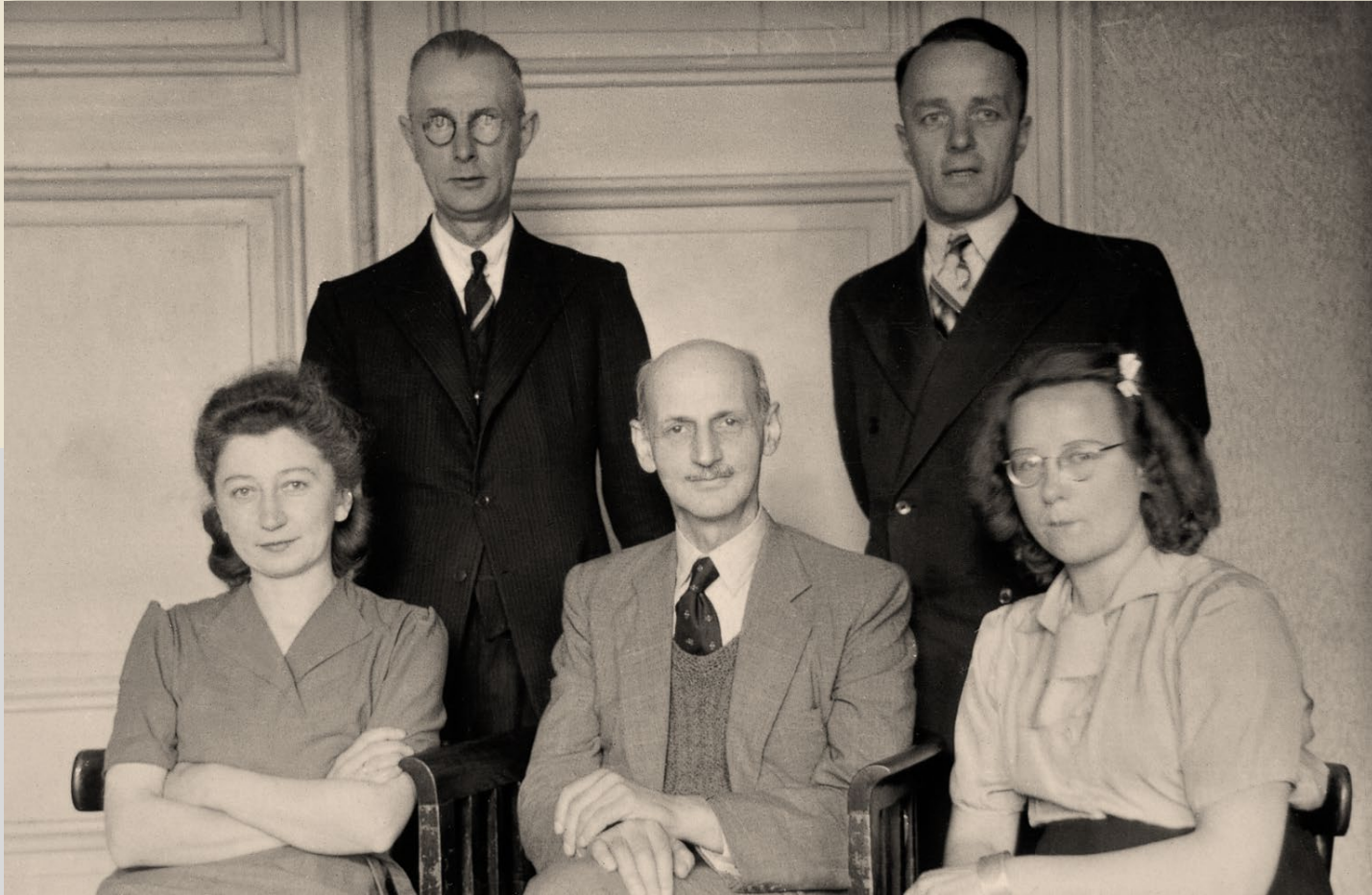
Otto Frank (middle) and his Office Helpers